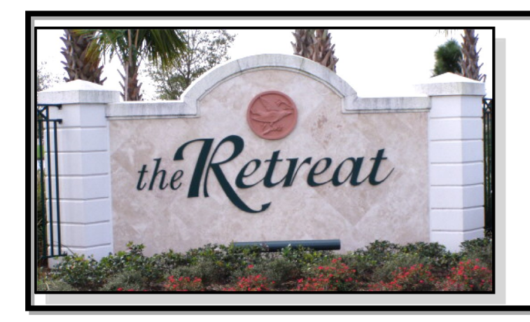
The Retreat Newsletter September/October 2021 Volume 18, Issue 4