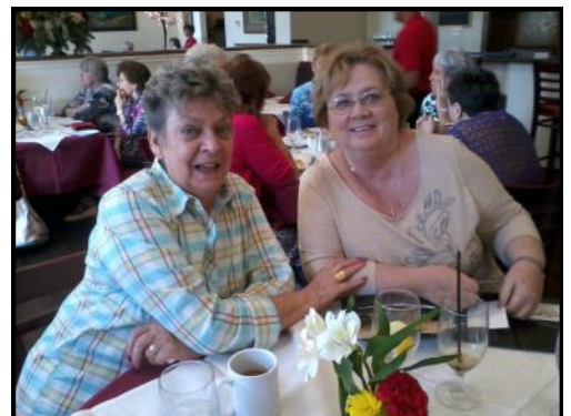
Luncheon at The Hunter's Grill