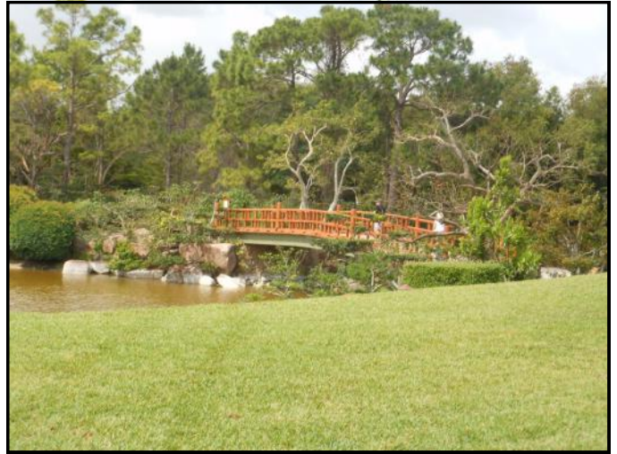
WOMEN'S CLUB GOES TO MORIKAMI GARDEN