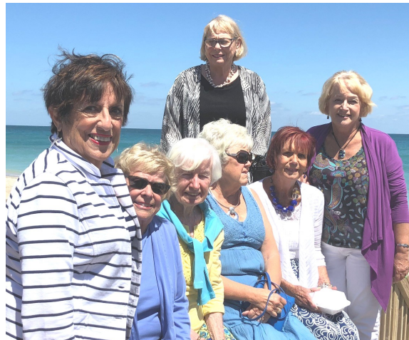
April luncheon at KyleGs Hutchinson Island