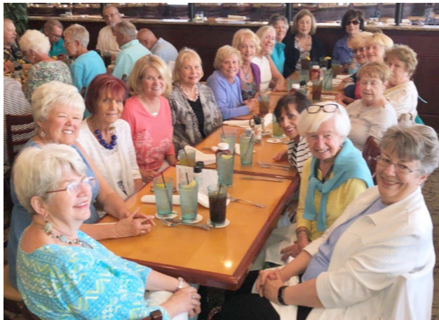
The Women's Club Lunch was on March 21st at Shuckers on Hutchinson Island.. a good time was held by all.