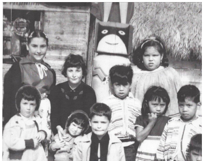
Our visit to the tribe with my two sisters, two cousins and five Seminole Indian children.

I sure hope that little boy had a good life and is still alive, somewhere!