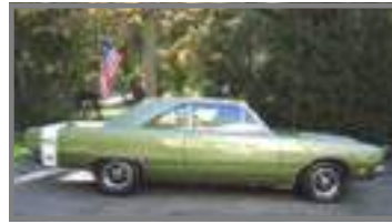
Restored 1969 Dart Gts 440

On the full scale side, I own three MOPAR products—a 2006 Chrysler 300C hemi, a 2006 Chrysler PT Cruiser Turbo and, the piece de resistance, a fully restored (you guessed it) 1969 Dodge Dart GTS 440 (525 hp)-same color and style as my original Dart. She too will be making it down to Hobe Sound in the near future to enjoy the beautiful weather and the many car shows that are in abundance in our area. I'll try not to make too much noise driving through the neighborhood on my way to the shows.