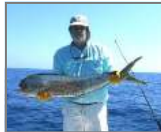
MY FIRST DOLPHIN IN MY NEW BOAT; KEEPER SNOOK AND FLOUNDER