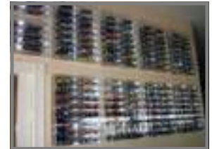
Part of 200 1:32 scale slot collection