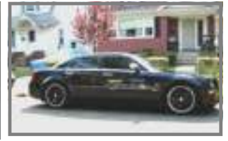
2006 Chrysler 300C HEMI