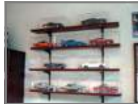
Part of 1:18 scale diecast MOPAR Collection