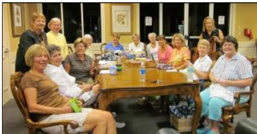
KNOT JUST KNITTING LADIES