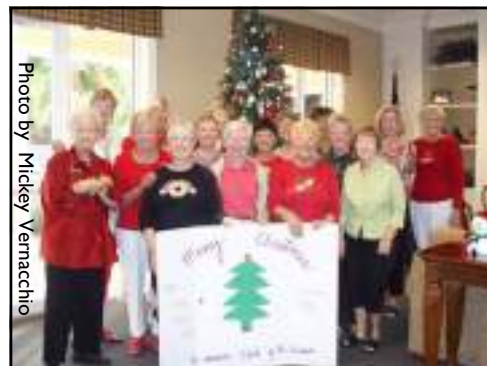
Women's Club Christmas Party—all signed the large Christmas card for our military family