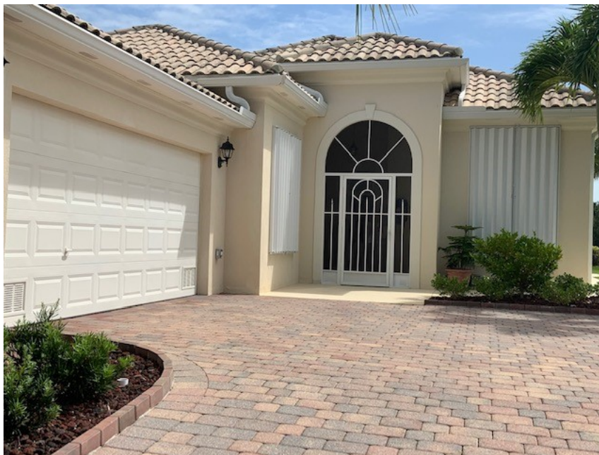
OUR HOUSE SHUTTERED